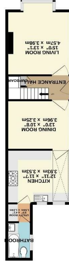
GROUND FLOOR 614 sq ft. (57.1 sq m.) approx.